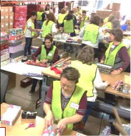
Big Event service project at Hope Supply. Don't we look legit in the vests?!