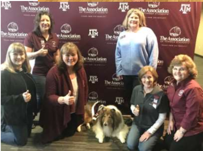
Winter Federation Meeting