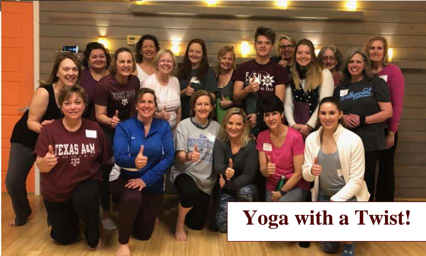
Yoga with a Twist!