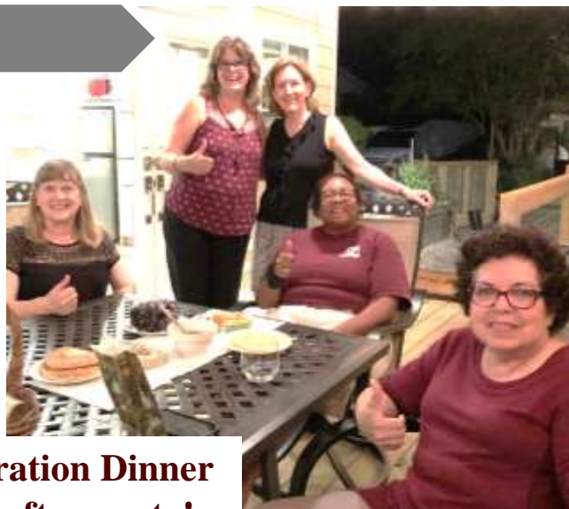
Federation Dinner and after-party!