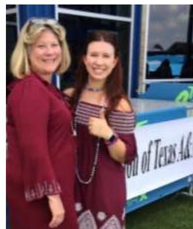
Aggieland Outfitters fashion show