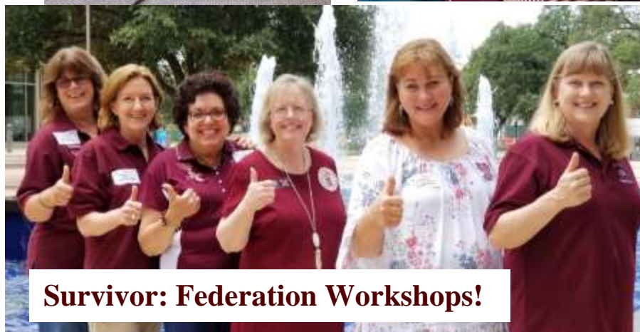
Survivor: Federation Workshops!