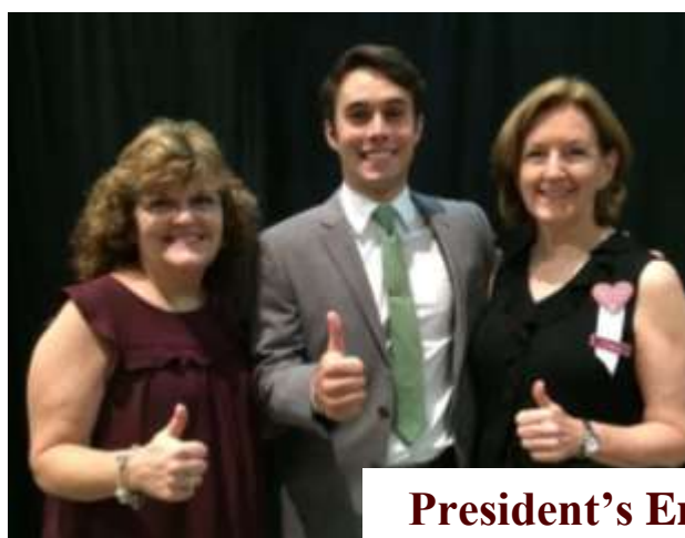
President's Endowed Scholarship Reception